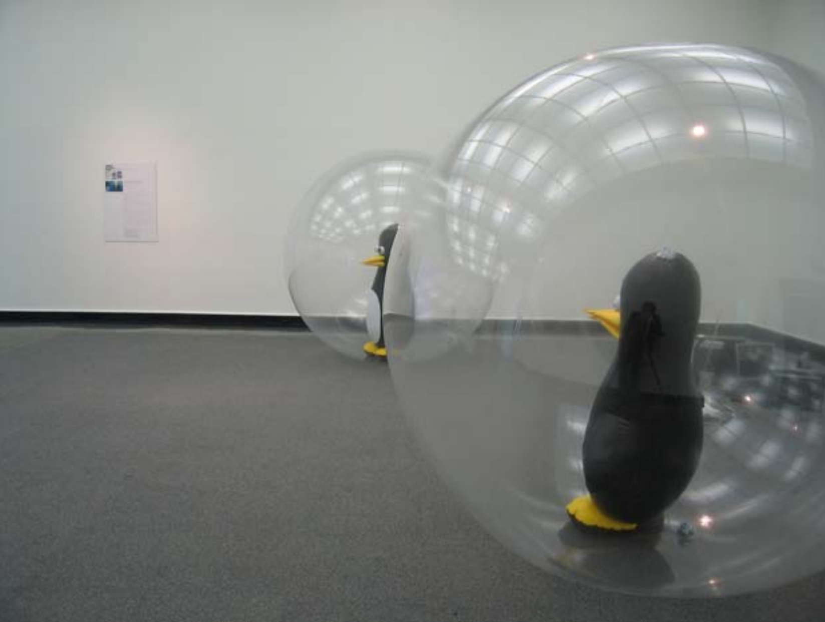
Cubey Penguin Ball 2 da série Objects of Virtual Desire Goldin+Senneby Instalação