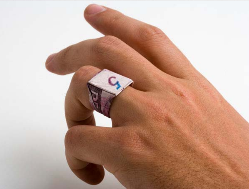
Transeconomia Real (2007) Marcelo Cidade objeto em papel moeda 2,5 x 2,5 x 5 cm cada (políptico)