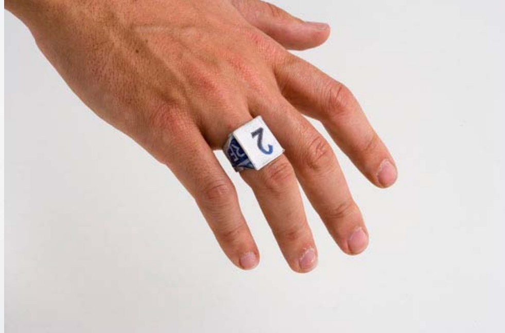
Transeconomia Real (2007) Marcelo Cidade objeto em papel moeda 2,5 x 2,5 x 5 cm cada (políptico)