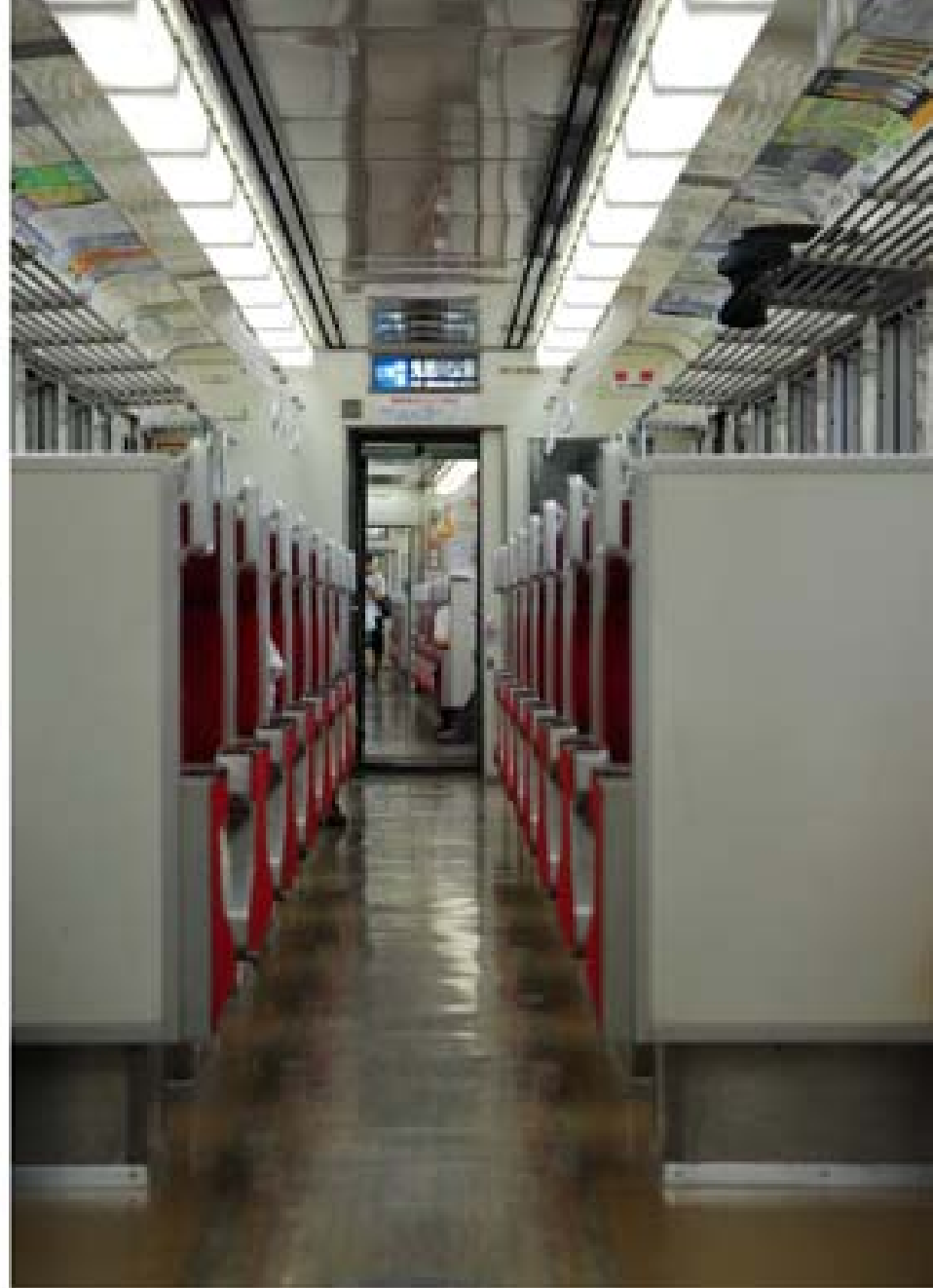
"Em caso de... 3"