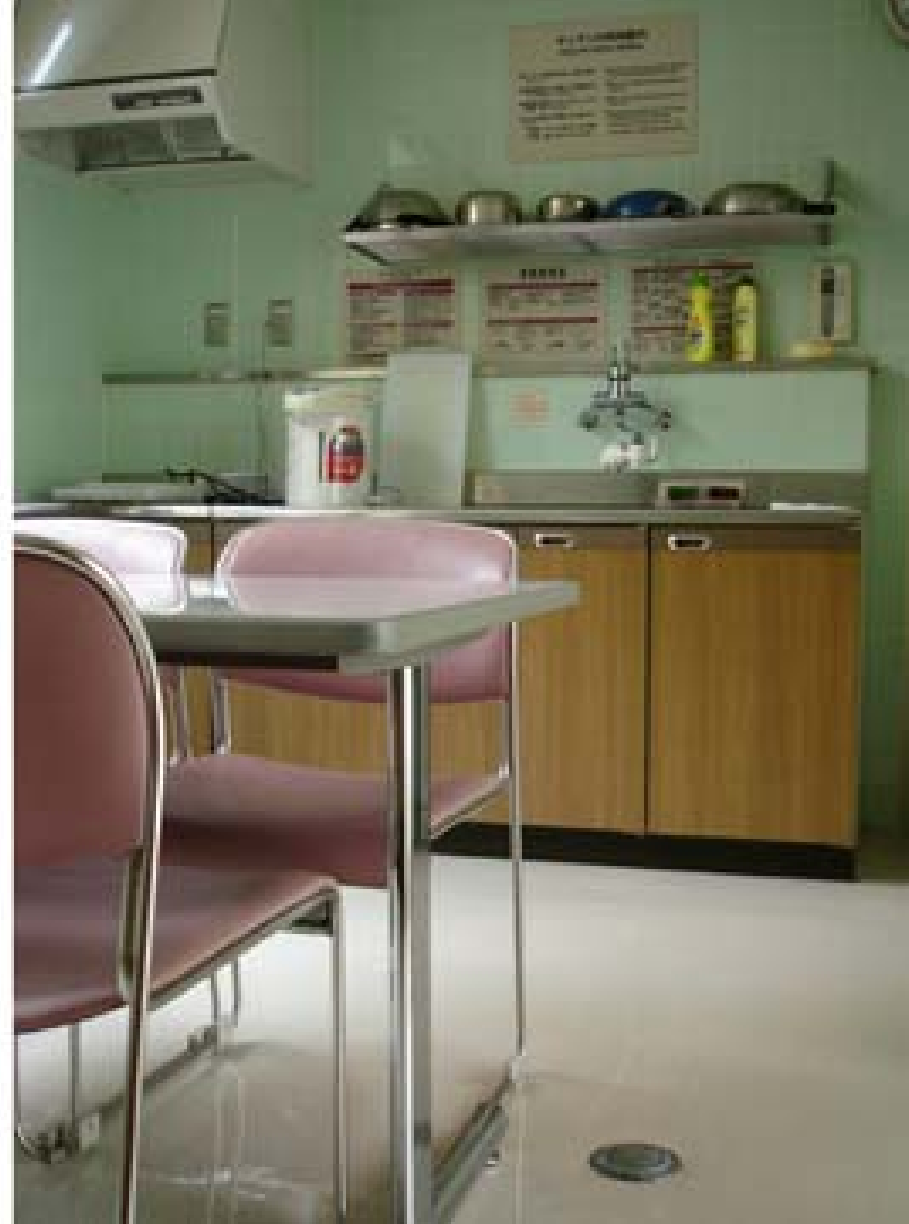
"Em caso de... 1"