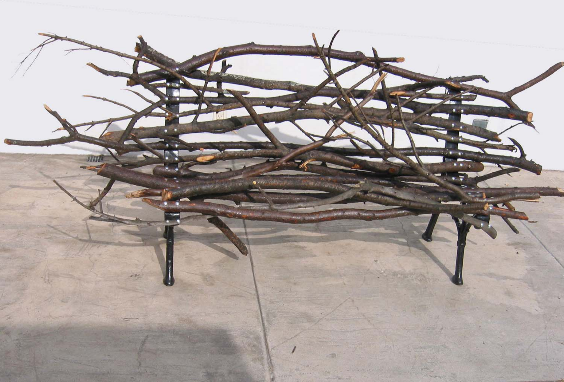
Banco de jardim, 2006 Marcius Galan madeira e metal 108 x 236 x 85 cm