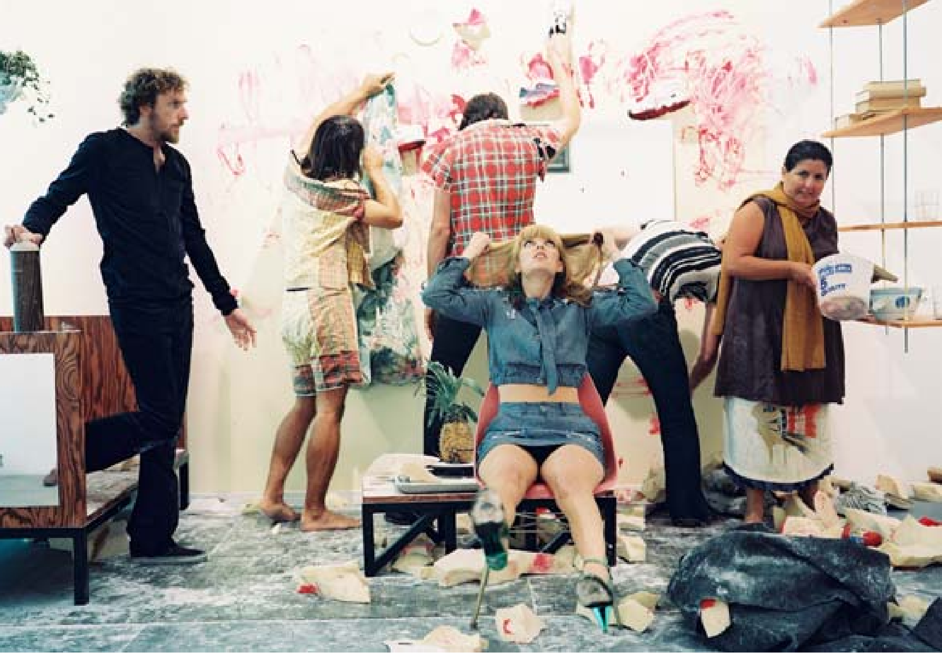
THE TECHNICAL VOCABULARY Los Super Elegantes Instalação