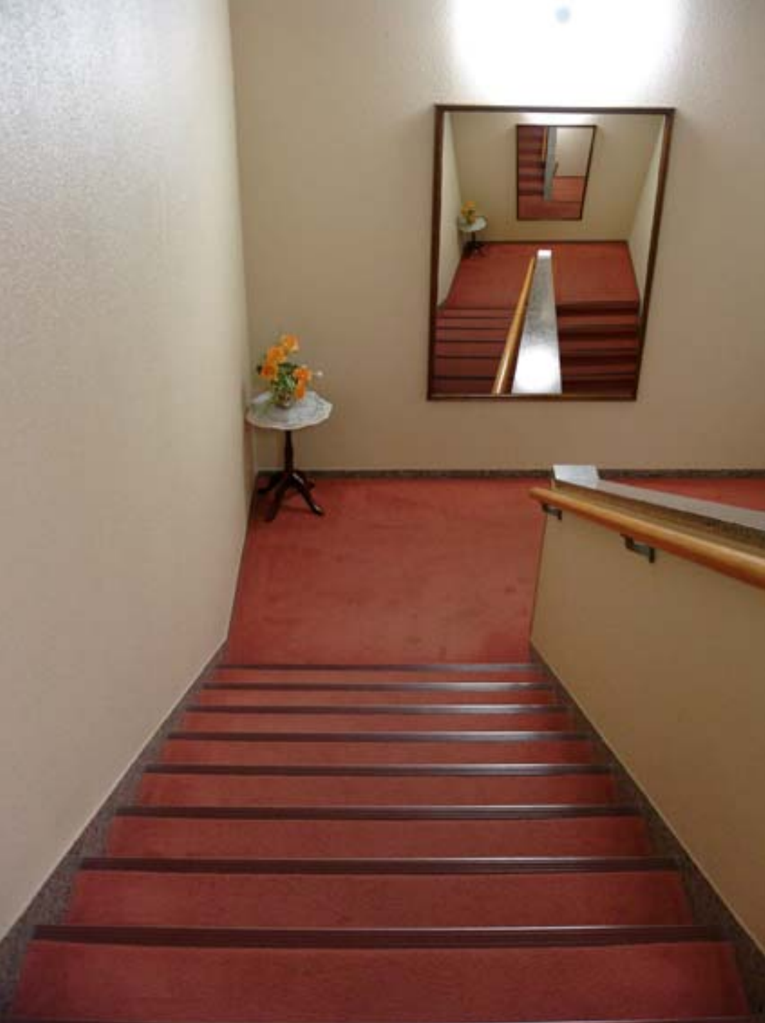
"Em caso de... 2"