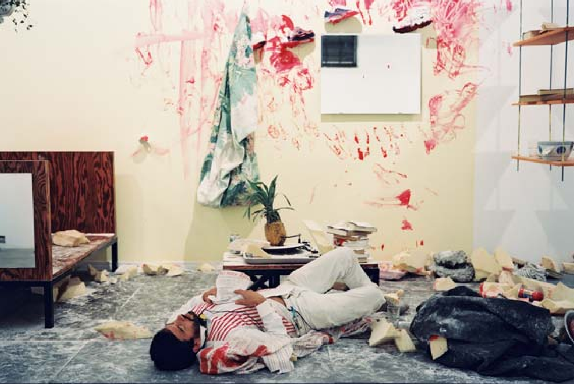
THE TECHNICAL VOCABULARY Los Super Elegantes Instalação