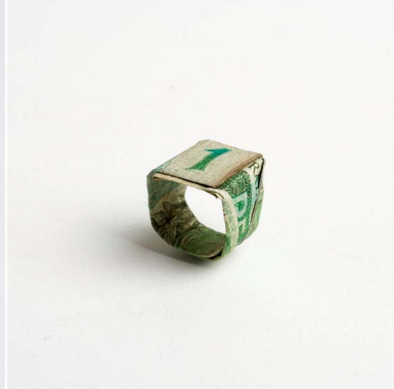
Transeconomia Real (2007) Marcelo Cidade objeto em papel moeda 2,5 x 2,5 x 5 cm cada (políptico)